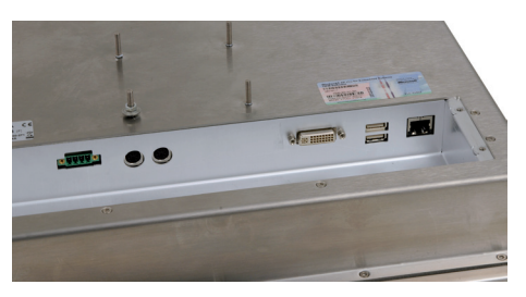
Access to direct board interfaces which can be covered with a plate