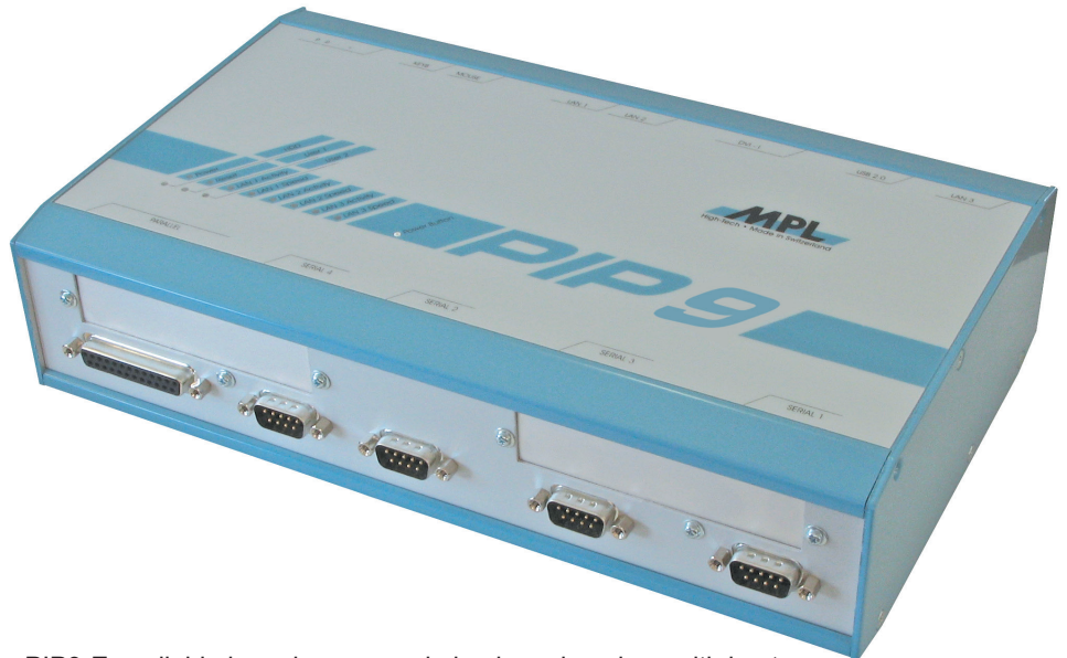
PIP9-E available in various rugged aluminum housings with best EMI/RFI protection (inside chromated, externally powder coated/anodized)

the PIP9-E to the ideal solution for any application where a high performance PC with a low power consumption and/or extended temperature next to the reliability is required. Additionally you benefit from a high quality, very rugged, small size, and expandable Industrial PC solution. The PIP9-E is widely used in vision, medicine, transportation systems, telecom, and in industrial applications.