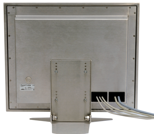
PANEL19 view from back