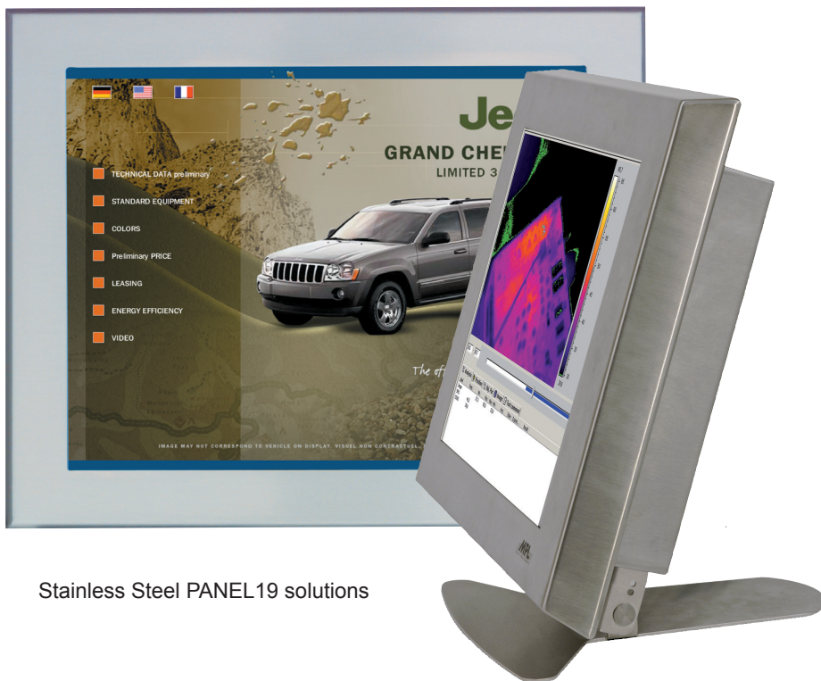
Stainless Steel PANEL19 solutions

The robust and all around IP65 protected PANEL19 is the perfect solution as man machine / front end interface for harsh applications like in transportation, maritime or for clean environments like in medicine, food industry. Further as space saving, IP54 protected, fanless and noiseless system the PANEL19 is an excellent solution for desktop applications in telecommunication, kiosk information systems and Internet access points where a quality product is an issue.