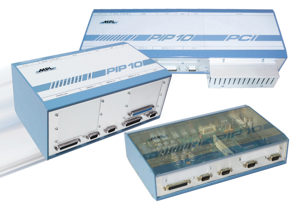
PIP10 in various rugged aluminum housings with best EMI/RFI protection (inside chromated, externally powder coated or eloxated)

the PIP10 to the ideal solution for any application where a high performance PC with a low power consumption is required. Additional you benefit from a high quality, very rugged, small size, and expandable Industrial PC solution. The PIP10 is widely used in vision, medicine, defense, transportation, telecom, and in industrial applications.