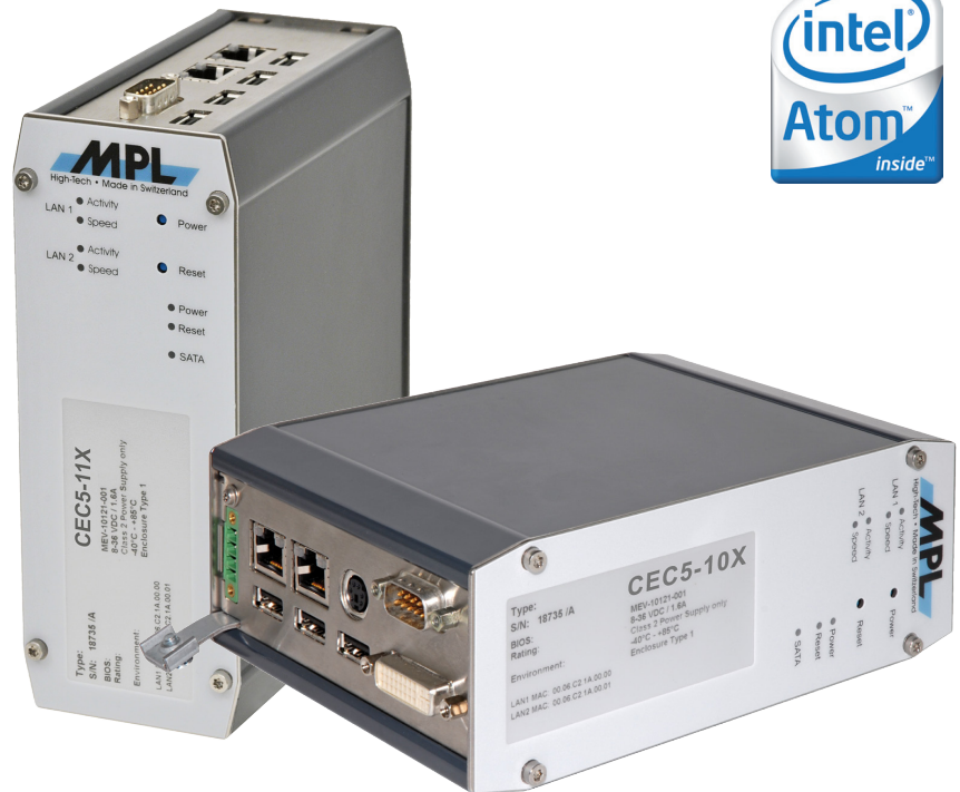
CEC5-X dimensions: 62 x 162 x 118 mm (W x H x D) Compact rugged aluminum housing with stainless steel side plates